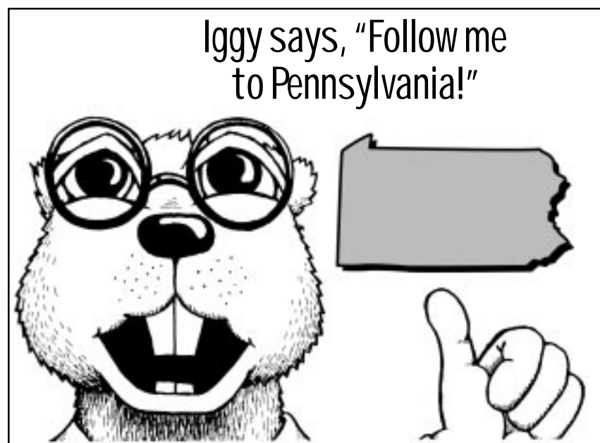
Iggy the Groundhog is the official educational mascot of IGSHPA.