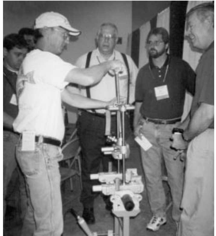
Students are hands-on testing with the McElroy Sidewinder™ (above) and the No. 28 Fusion (at left) machines.

The Training Committee, in addition to approving the course structure, determined that students who passed the tests gained one continuing education point (CPU). The Advisory Council approved the course and CPU award.