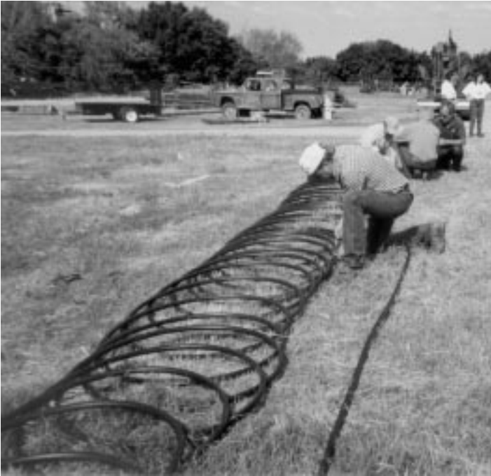
Demonstration Day showed attendees the finer details of slinky assembly.